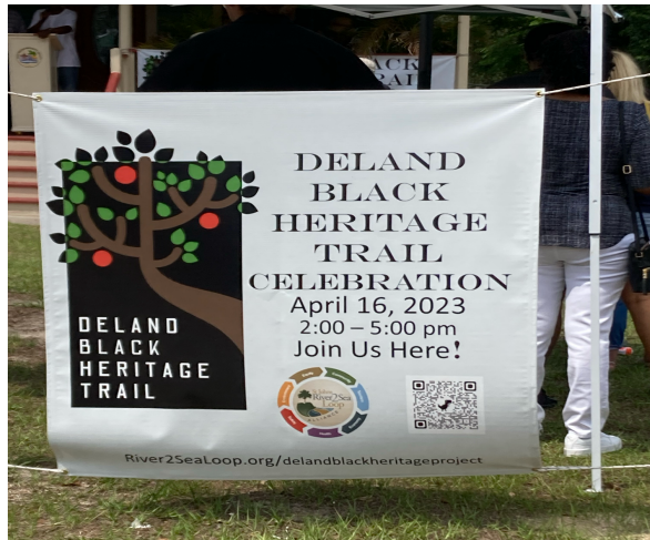
Heritage Trail Celebration Banner

About 10 Friends dropped in on a Zoom meeting during a 90-minute period set aside to commemorate Earthday. Greetings were shared from Quaker Earthcare Witness Steering Committee members who