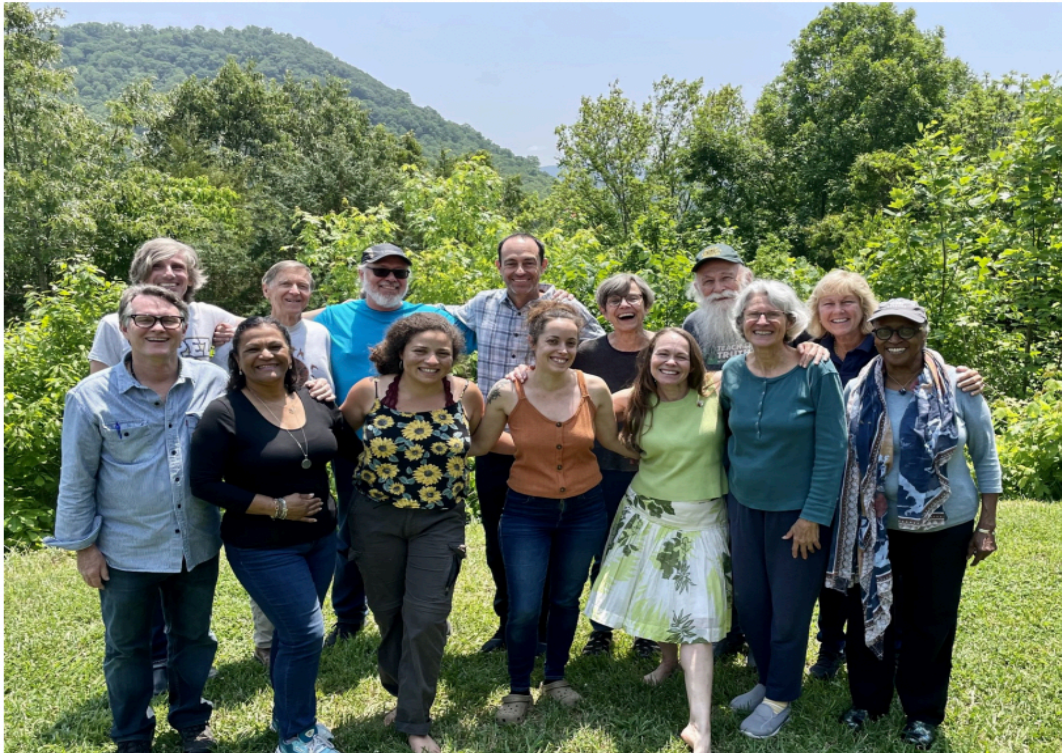
Attending EEI National Advisory Board members, EEI staff, partners, and members of the Narrow Ridge community gather in front of Strawbale Lodge