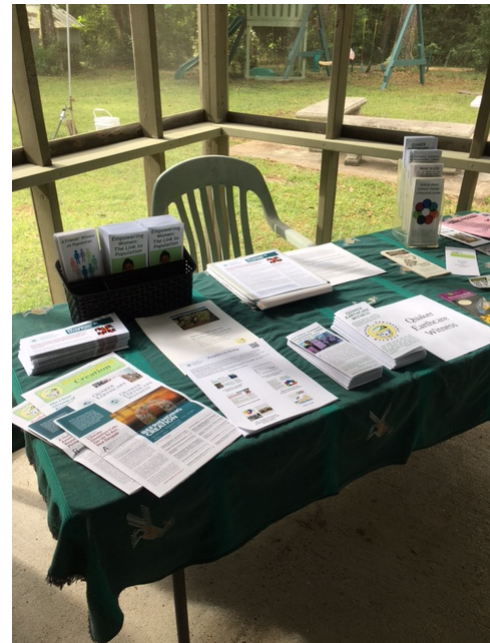
Tallahassee MM Display