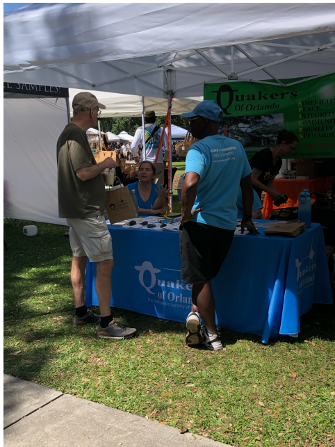
30 | Orlando MM Booth SEYM Fall Executive Committee Meeting 2023 Minutes

I also helped Orlando Monthly Meeting and Tallahassee Monthly Meeting stock their Earthday booths with pamphlets from Quaker Earthcare Witness. Due to the pandemic and limited travel, I have not been as active in dropping off pamphlets in person.